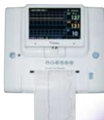
Wall mount style